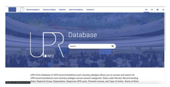
UPR-Info database issue search menu

Affairs (or equivalent) will take the lead.