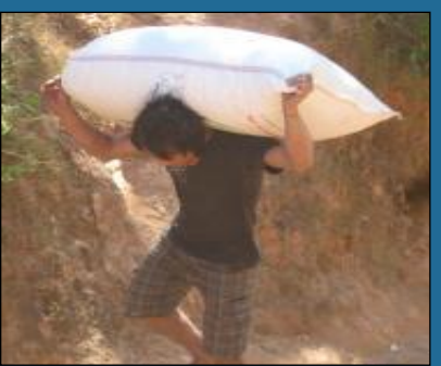
A forced laborer belonging to the Karen ethnic group

The Karen people are an ethnic group residing in the southeastern region of Myanmar (Burma) along the border with Thailand. The Karen Human Rights Group (KHRG) is a grassroots, locally led human rights organization established in Karen (Kayin) State in 1992 and now operating across southeast Myanmar. KHRG works with villagers in rural Myanmar to strengthen their ability to claim their human rights; interview each other about human rights violations; document their human rights situation; and conduct local and international advocacy. Over its 30-year history, KHRG has established itself as a leading source of information of on-the-ground conditions in Myanmar for the international human rights community and has been nominated twice for the Nobel Peace